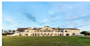
Sawgrass Country Club