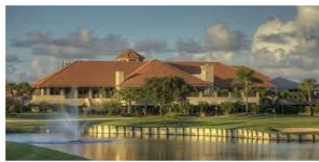
Frenchmen's Creek Beach & Country Club