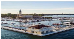
Grosse Pointe Yacht Club